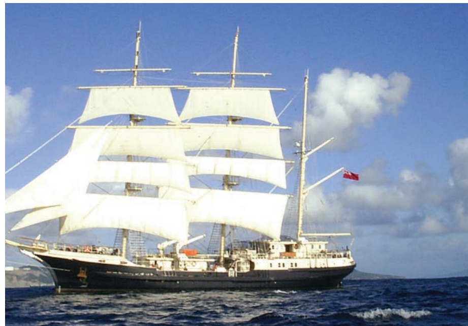
The Jubilee Sailing Trust, page 4