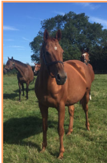
Coplow with friends at Stowell Hill Farm