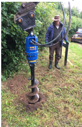
Meade lane hole drilling