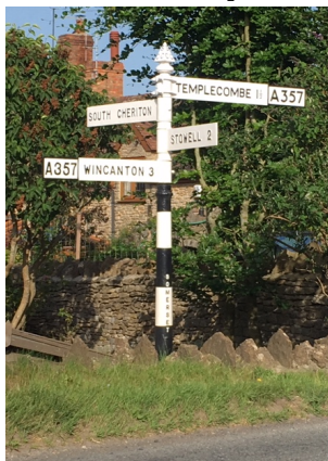
South Cheriton completed