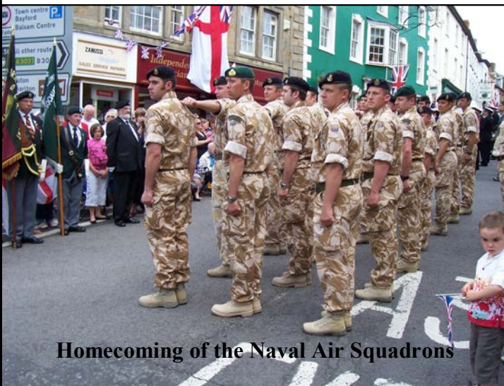
Homecoming of the Naval Air Squadrons