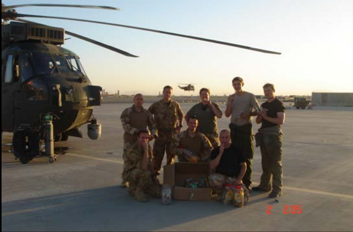
Some of our sweets arriving in Afghanistan 2008