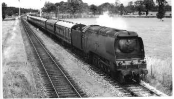
A view northwards from the railway bridge, with a Bath to Bournemouth train approaching, probably dating from the 1950s.

The SDJR continued to be a Joint line run by two Companies up until nationalization in 1948. In 1958 the SDJR line passed into the control of the Western Region of British Railways, therefore doing away with the incongruity of a line being jointly run by two different Regions of British Railways. Traffic by this time was drifting away, Continental Holidays, the increase in Motor Vehicles and the North Somerset Coalmines closing. And with alternative routes available for through traffic, such as Bristol-Taunton-Exeter or Reading-Basingstoke-Southampton, it was sensible to move trains away from the difficult route over Mendip.