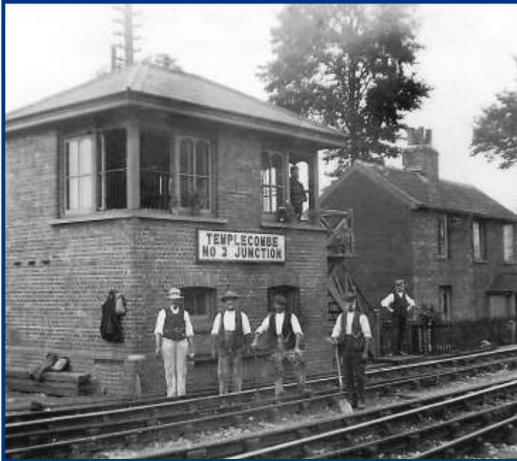
Early 20th century picture of the Crossing Keepers Cottage at Broadmoor Lane