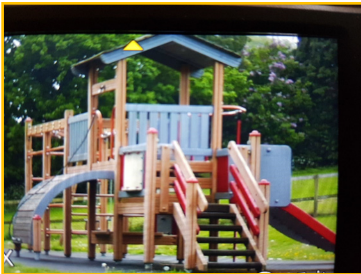
Horsington Play Area