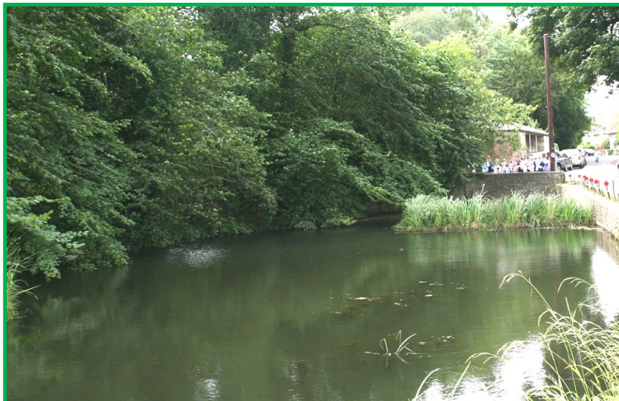
Village Pond after recent restoration