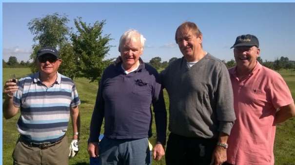
The Half Mooners