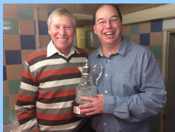
Two of the White Horse Wishfulls