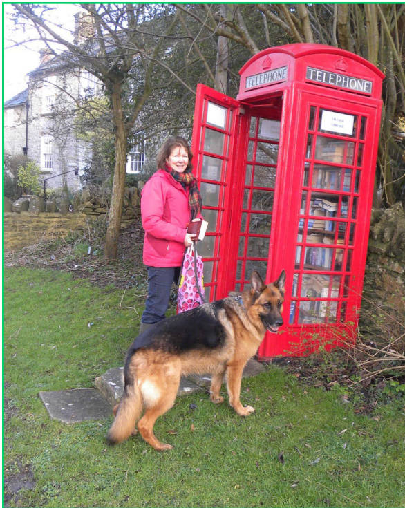
Cato at South Cheriton village library

I do not regret bringing him with us; although in some ways he limited the experience, he enriched it far more. I would rather he had not had to endure two long distance flights, but I am very glad to still have his company, and I think he mine, especially with the sailor being back at sea!