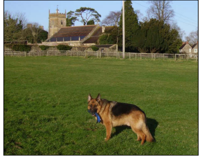
Cato with Horsington Church in the background

In September 2011, after 25 years in Australia, my husband and I returned to our native country and Europe for a few years. Retirement, and a favourable exchange rate made it possible. Our three children were independent - one was living in the UK at the time – but we did have a 4 year old German Shepherd dog. Cato had been re-homed once by a previous owner, and had recently been diagnosed with a chronic eye condition – Pannus, which required daily topical medication to prevent him going blind. I would not re-home him again, and so he came with us.