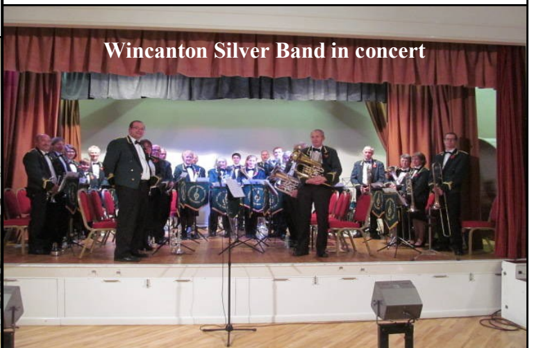
Wincanton Silver Band in concert