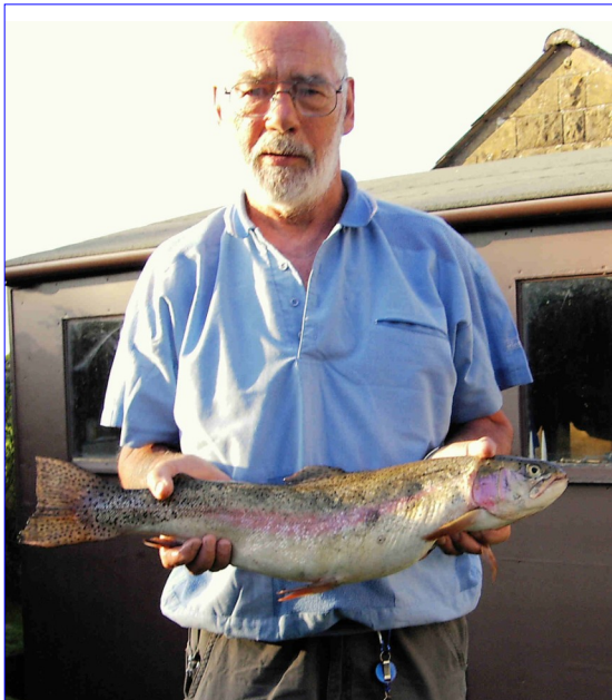
With 6lb trout

Fishing has proved to be the gateway to another world of peace and tranquillity, making the fisherman at one with nature, observing many animals and birds and has proved to be very therapeutic both mentally and physically.