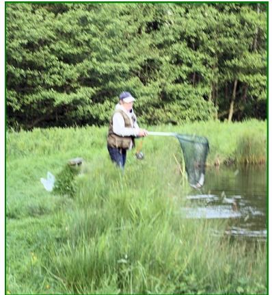
Peace and Tranquillity