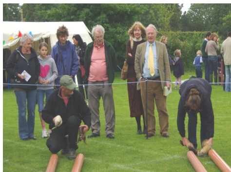
Setting up for the Ferret Race

All in all, the hard work organising the event was worth it.....so what's next.....oh..... the Race Night in October – watch this space for details.