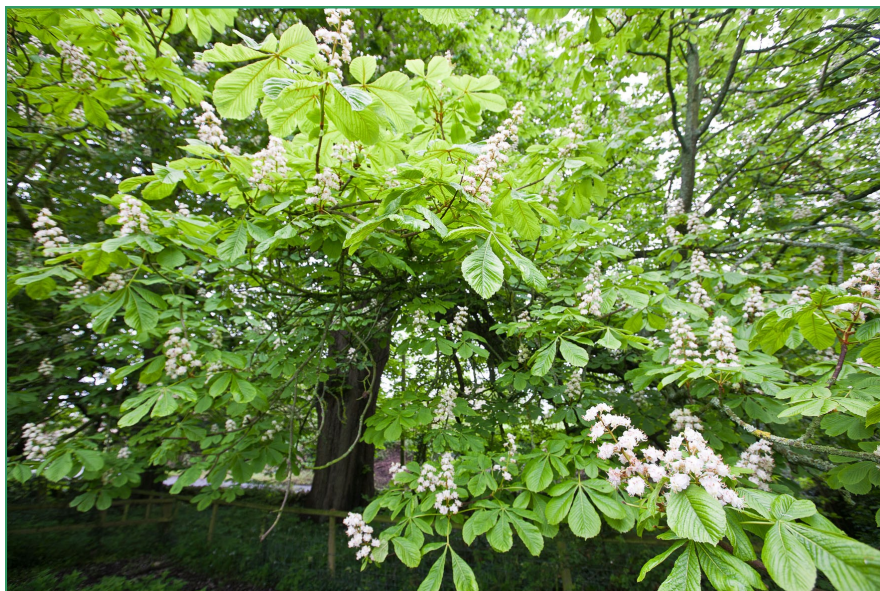
Horse Chestnut in the gardens of The Grange in Horsington