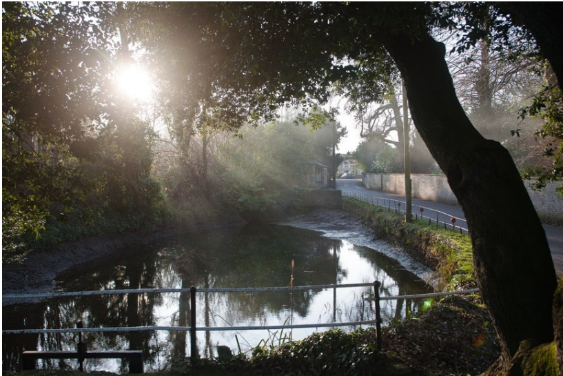
Horsington Pond