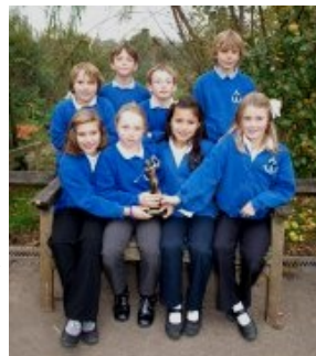
The Golf Team

Our Year 5 children attended a golf morning and learnt a great deal about playing a sport which few of them had ever experienced. They then played in a tournament against other local schools and won!