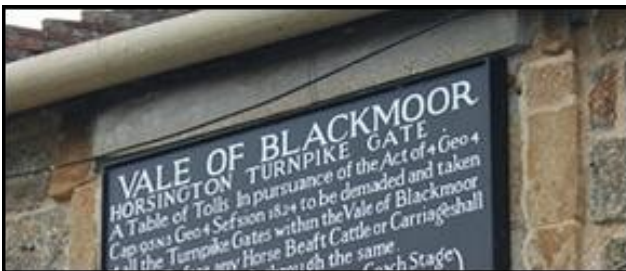
Horsington Turnpike Gate Plaque on The Old Toll House, South Cheriton

Look out for a follow-on article on the Toll House in South Cheriton where you will find out more about the plaque displayed below.