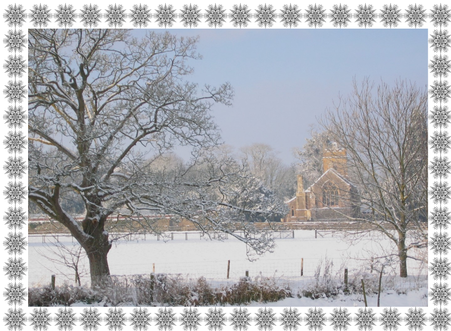
Christmas Scene with Horsington Church