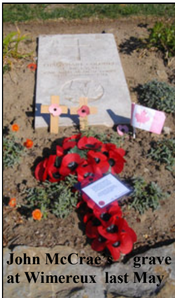
John McCrae's grave at Wimereux last May

The verses were sent anonymously to 'Punch', magazine and published under the title 'In Flanders' Fields'.