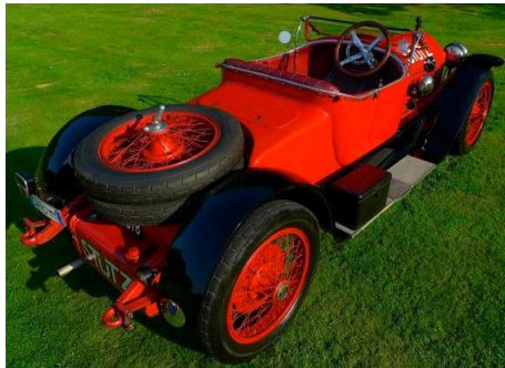
1917 Stutz Bearcat