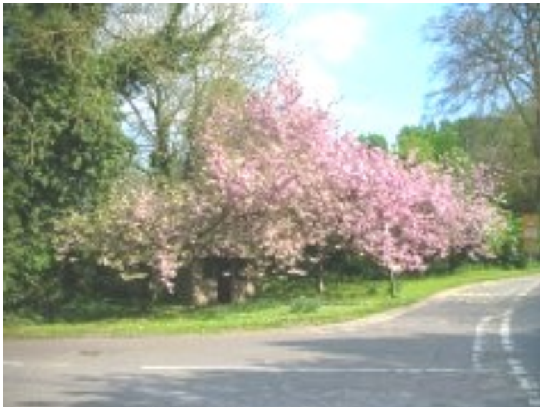
Cherry Blossom in Horsington dip