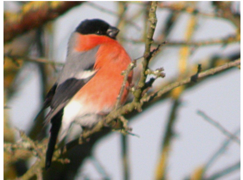
The Male Bullfinch

This walk down to the River or indeed any of our local walks alongside a hedgerow this month should turn up a Bullfinch or two which seem to be particularly numerous this year. The grey and black female is very attractive but the male with its bright pink and black against the green of a hawthorn bush is a stunning sight.