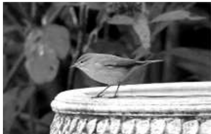
Chiffchaff on a bird bath