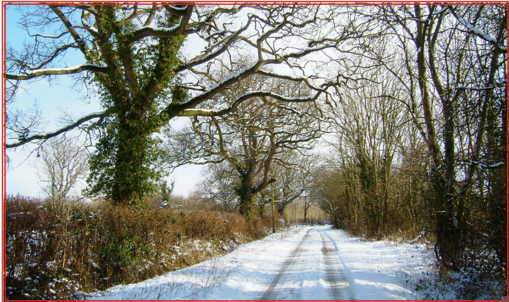
Horsington Marsh lane in the snow