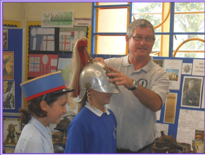
The French and the Austro Hungarians