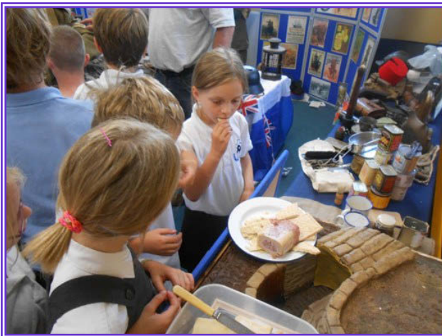
Bully Beef – Yum!

www.horsingtonprimary.co.uk www.facebook.com/HorsingtonSchool www.twitter.com/HorsingtonS